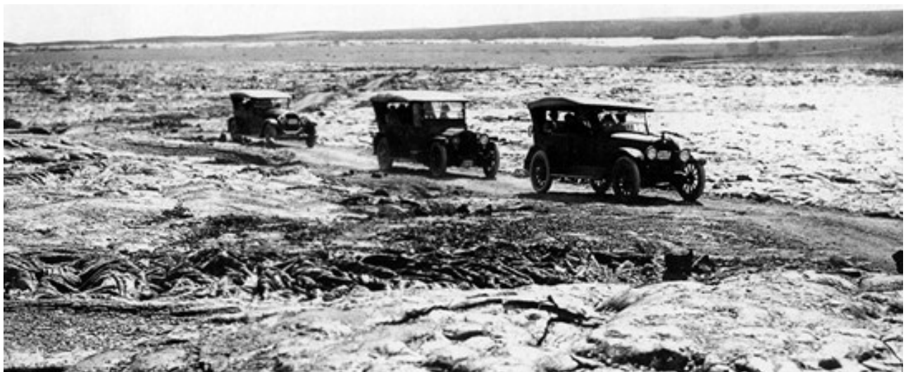
Automobiles traveling across lava to Kīlauea, ca. 1924.