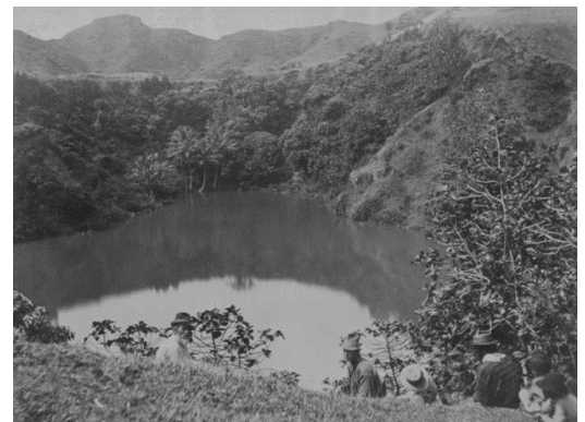
Top: Lava in Halema’uma’u Crater, Kīlauea ca. 1940. Middle: Red lehua in Wao Kele O Puna, Hawai’i. Bottom: Green Lake or Ka Wai o Pele, Kapoho, Puna, Hawai’i, ca. 1890s.