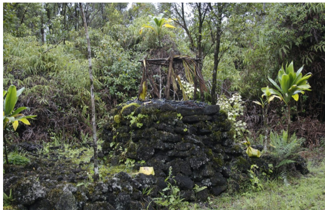
An ahū (altar), Wao Kele O Puna.

The acquisition of Wao Kele O Puna represented the first time ceded lands were returned to an entity specifically designated to manage Native Hawaiian lands in trust. Under a unique memorandum of agreement, Wao Kele O Puna will be jointly managed by OHA and DLNR until 2016. The agreement directs DLNR to teach OHA staff about current land and natural resource practices, while OHA and surrounding communities will teach DLNR staff about the integration of traditional Native Hawaiian stewardship.