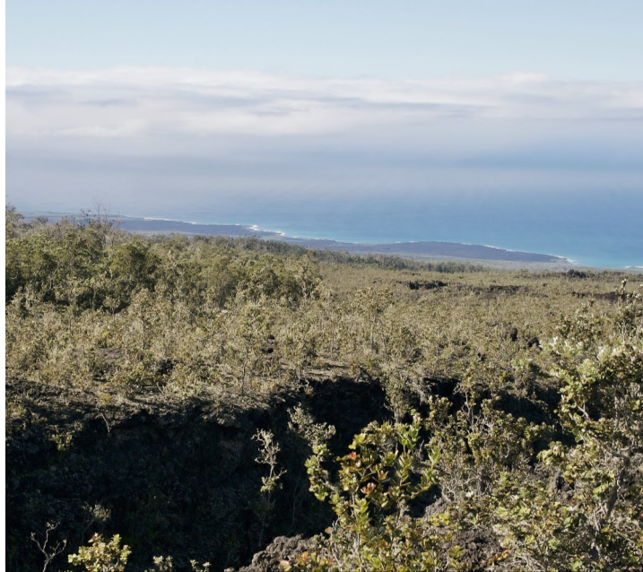
A fissure in Wao Kele O Puna, Puna, Hawai'i.

This also led to declines in traditional land tenure, resource management, and subsistence practices. Historical records indicate that the forests of Puna once covered greater expanses of land and descended further towards the coastline. However, beginning in the early 1800s, new types of economic activities would accelerate deforestation. The sandalwood trade, would peak in the early 1820s and resulted in the extraction of sandalwood from the forests of Puna. Sugar cultivation, ranching, and the pulu (fern wool) industry would all increase deforestation in Puna.