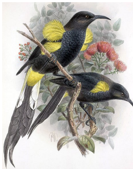
The extinct Hawai'i Island 'Ō'ō. Source: Rothschild, 1907.

Systems of lava tubes and caves formed by ancient volcanic activity are present in Puna. Native Hawaiians sometimes lived in these formations, which offered shelter to travelers and bird catchers. Hawaiians also used the caves and lava tubes for burials; a number of these sites have been identified within Wao Kele O Puna (Matsuoka et. al, 1996).