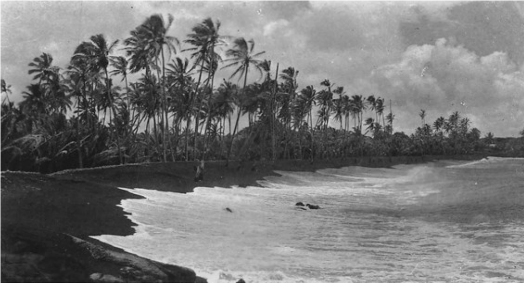
A black sand beach, probably Kalapana, Puna on Hawai'i Island, ca. 1940.

Mo'olelo (historical legends) reveal the nature of life in Puna. Puna is an especially sacred district because of its easternmost position in the Hawaiian islands as well as its association with the sun and the akua (god) Kāne. The morning sun first touches the islands at Kūmukahi (beginning, origin); nearby Ha'eha'e is known as the eastern gate of the sun. As a result, these place names often appear symbolically in mele (compositions) (De Silva, 2013).