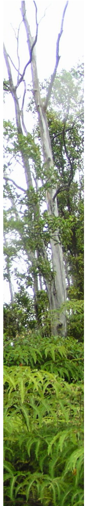
Left: Uluhe fern and 'Ōhi'a in Wao Kele o Puna, Hawai'i.