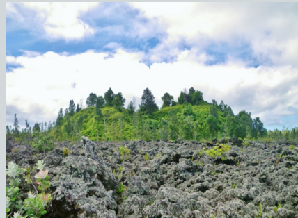
Wao Kele O Puna.

Residents of Puna expressed a number of concerns regarding the geothermal development. Many members of the community felt that their health and safety were threatened by hazardous emissions of toxic gases at the power plant and well sites. Plans for producing energy for Honolulu that would be transmitted through an undersea cable also angered residents. Conservation advocates and scientists decried the destruction of the forest. Additionally, many Native Hawaiians believed that extracting geothermal energy desecrated the akua Pele and inhibited traditional cultural practices.