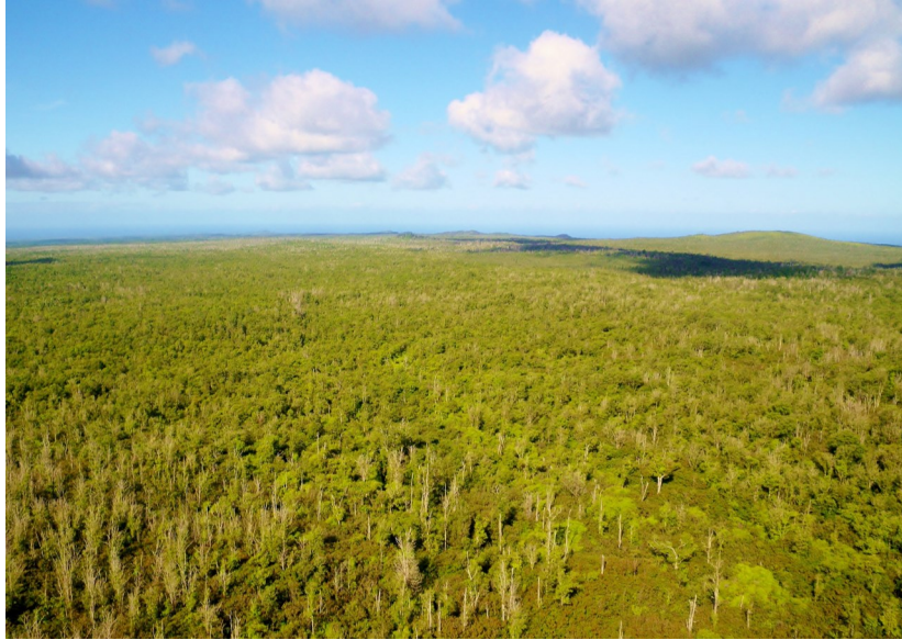
Aerial view of Wao Kele O Puna.