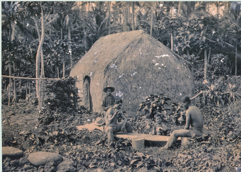
Hawaiians pounding poi in Puna, Hawai‘i, ca. 1897–1898.

Puna was well-known for treasured mea waiwai (raw materials and other items of value) such as bird feathers, canoe trees, and cordage, that were prized throughout the islands. Puna was famous for its ‘ awa ( Piper methysticum ), which was said to be particularly potent. Extensive niu (coconut) and hala (pandanus) groves once grew from Kapoho to ‘Opihikao (Handy et. al, 1991), and Puna was renowned for the ahu moena makali‘i (mats of a particularly fine weave). Puna was also known for unique kapa (bark cloth); the eleuli was dark colored and perfumed and the ouholowai was made from māmaki ( Pipturus albidus ) that was colored differently on its two sides (Kauai, 1865).