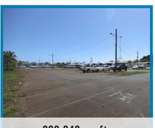
200,942 sq. ft.