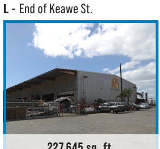
227,645 sq. ft.