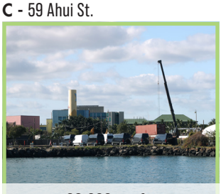
88,996 sq. ft.