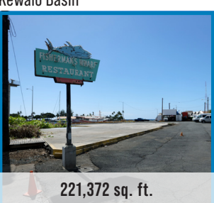
B - 123 Ahui St. and 113 Ahui St.