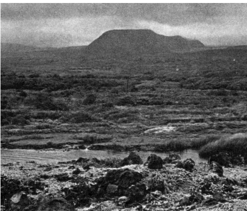
Top: Kaulia Pond. Bottom: Nīnole Cove, looking toward 'Enuhe Hill (1970).

Ka'ū is known for its deep waters and strong currents. It is possible to catch deep sea fish from the cliffs at Kalae. The famous surf breaks at Kāwā, Punalu'u and Paiāha'a were renowned. Hala'ea and Kāwili are the names of two strong currents of Kalae, which met at a point marked by the heiau (place of worship) Kalalea and the stone Pōhakukeau. Puehao in Kama'oa and Hale o Lono in Haleola were famous places of healing (Pukui, 1983).