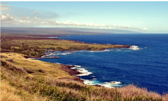
Ka'ū coast, looking over Honu'apo.

By the mid twentieth century, it is said that kahua maika remained only on Moloka'i and Lāna'i.