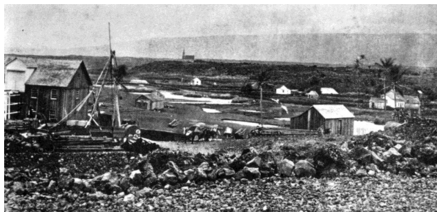
Top: Punalu'u, 1891, Courtesy of Kau Preservation. Middle: People in a Canoe, n.d. Courtesy of Kau Preservation. Bottom: Punalu'u Landing (1880) Hawaii State Archives Digital Collection.