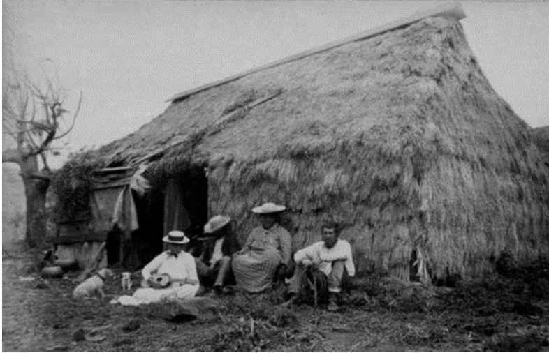
Hawaiians in front of grass house, in Nā'ālehu.