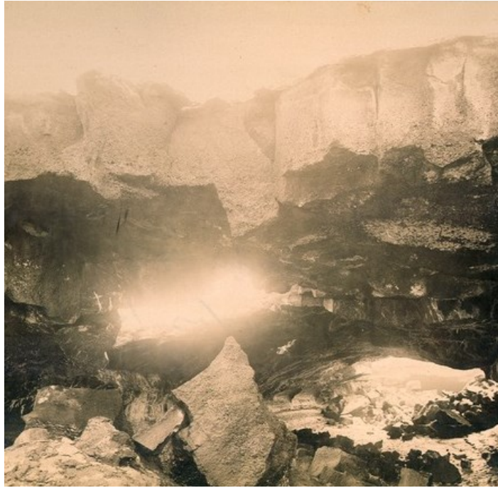
Volcano after earthquake, 1887.

Although other parts of the island were affected by these natural disasters, the Ka'ū coastline suffered the most damage and the highest number of casualties.