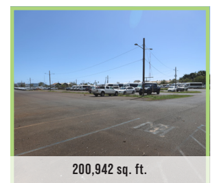
F - 160 Ahui St.