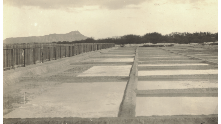
A traditional activity in the Kaka'ako area was salt production. Salt was extremely valuable, not just as a seasoning, but as a preservative. This photo of salt ponds in Kaka'ako was taken around 1890.