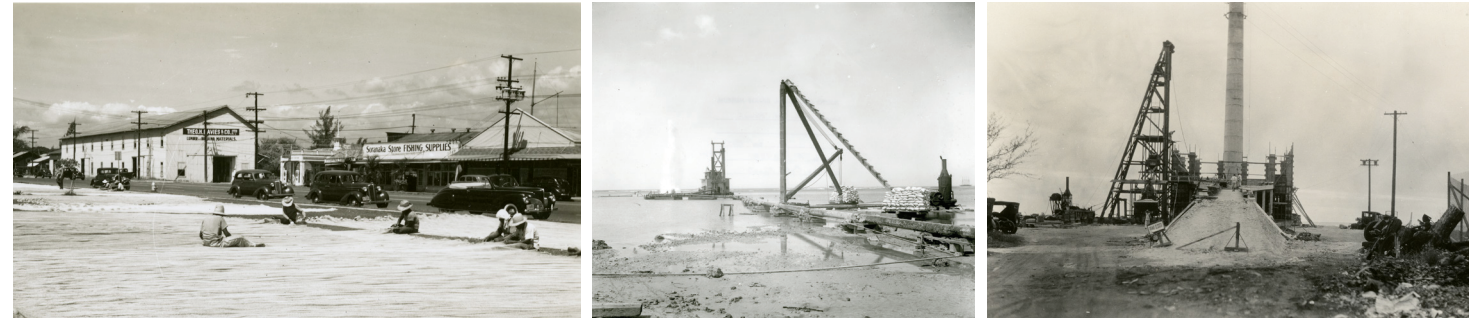
L-R- Fishermen repair nets at Kewalo Basin in 1940. | The landscape of Kaka'ako was forever changed as a result of dredging activities and infilling of wetlands, fishponds and reefs to create "usable" land. This is a photo of dredging at Kewalo Basin in 1913. | For decades coastal land in Kaka'ako was used as an enormous garbage dump. The first incinerator was built at Kaka'ako in 1905. The second incinerator, pictured here, was built in 1930.