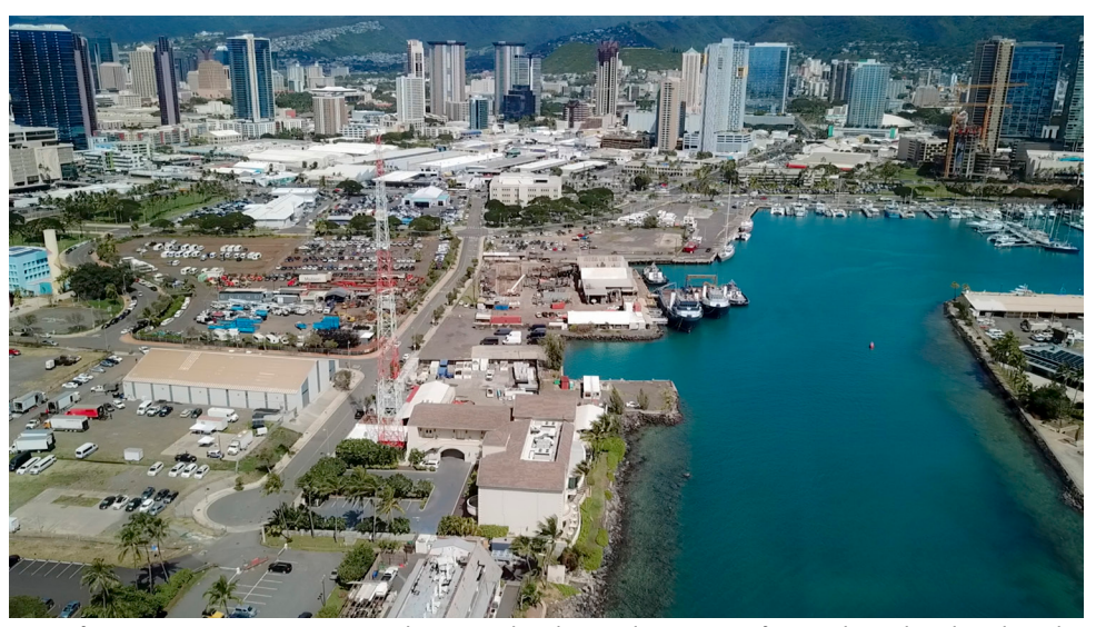
Some of OHA's most picturesque commercial properties line the Kewalo Basin waterfront.