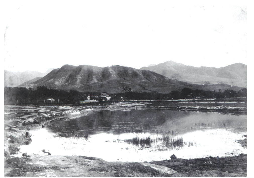
A view of Punchbowl Crater from the Kaka'ako/Kewalo area in 1885. The area was renowned for its wetlands and fishponds.