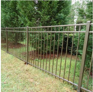
ALUMINUM FENCE (5 FT HT.)