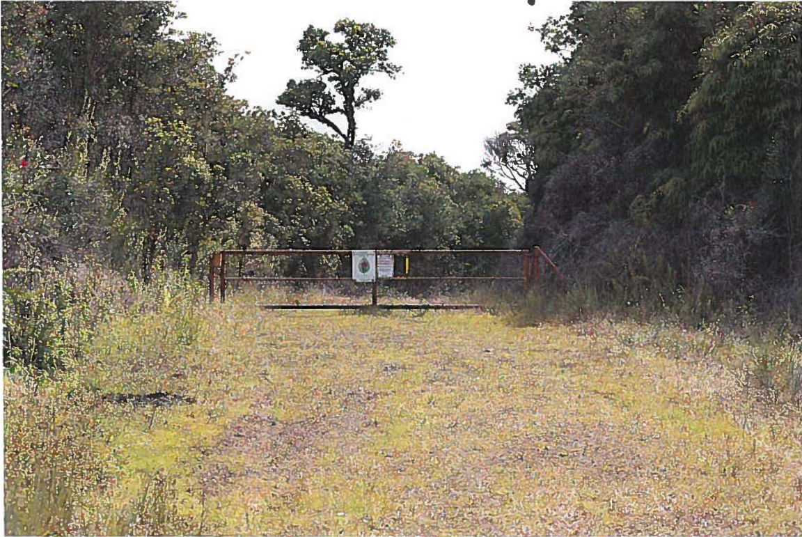
View of gate from afar