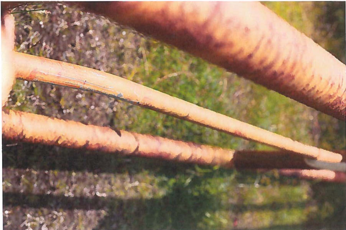
Close up of bent pipe